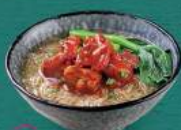
NO 30 红烧排骨汤面 Braised Pork Rib Soup Noodle

金华火腿汤 OR 麻辣汤 Jinhua Ham Soup OR Mala Soup