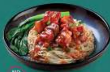
ND 10 红烧排骨干面 Braised Pork Rib Dry Noodle