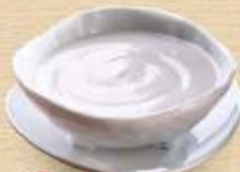
HD 02 水磨杏仁糊 Almond Paste