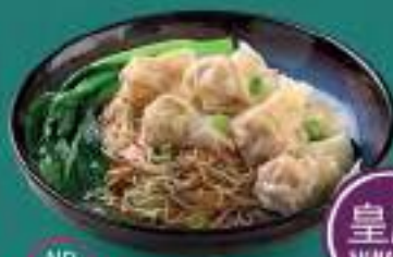
ND 01 皇牌云吞干面 Signature HK Wanton Dry Noodle 蚝油酱 OR 香辣鱼香酱 Oyster Sauce Spicy Fish Fragrant Sauce