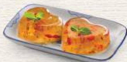
CD 29 清香桂花糕 (两件) Osmanthus Jelly (2pcs)