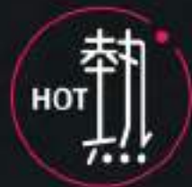
HD 12 汤圆加糊 (杏仁 / 红豆 / 芝麻) Rice Ball in Paste (Almond / Red Bean / Sesame)