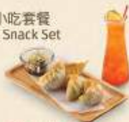
小吃套餐 HK Snack Set

虾酱鸡中翅 / 锅贴 + 奶茶(冷) / 自制柠檬茶(冷) Prawn Paste Chicken Mid Wing / Pan Fried Guo Tie + Iced Milk Tea / Iced Homemade Lemon Tea