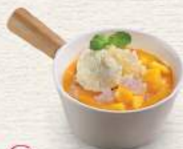
CD 28 盛記雪球楊枝甘露 SK Mango Pomelo Sago with Vanilla Ice Cream