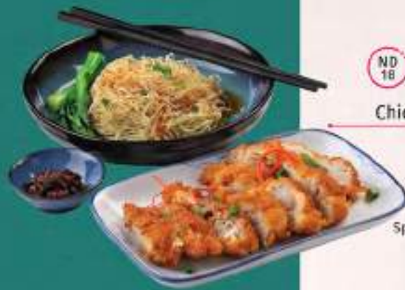
ND 18 香酥鸡扒干面 Chicken Chop Dry Noodle