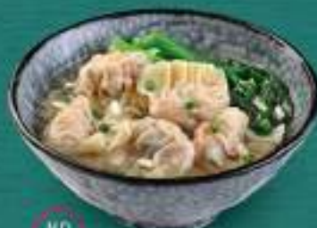
NO 06 港式水饺汤 HK Dumpling Soup

金华火腿汤 OR 麻辣汤 Jinhua Ham Soup OR Mala Soup