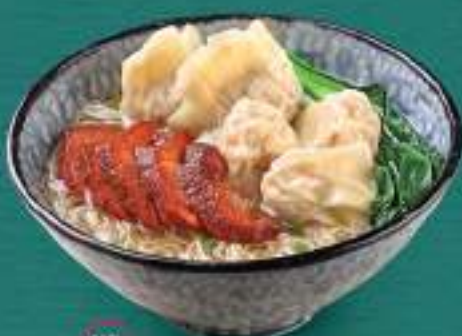
NO 15 盛記三拼汤面 SK Combination Soup Noodle

金华火腿汤 OR 麻辣汤 Jinhua Ham Soup OR Mala Soup