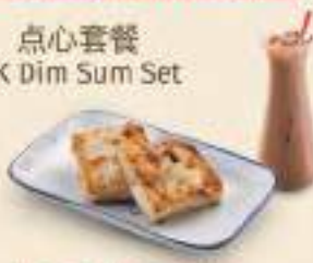
点心套餐 HK Dim Sum Set

港式萝卜糕 / 港式流沙包 + 奶茶(冷) / 自制柠檬茶(冷) HK Carrot Cake / SK Mini Lava Custard Pao + Iced Milk Tea / Iced Homemade Lemon Tea