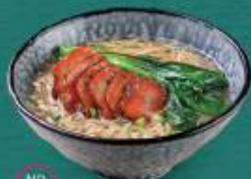
NO 03 港式叉烧汤面 HK Char Siew Soup Noodle

金华火腿汤 OR 麻辣汤 Jinhua Ham Soup OR Mala Soup