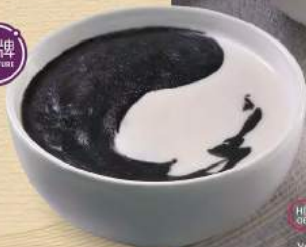
HD 06 鸳鸯糊 Yuan Yang Paste