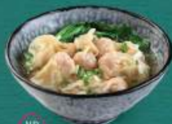
NO 05 皇牌云吞汤 Signature HK Wonton Soup

金华火腿汤 OR 麻辣汤 Jinhua Ham Soup OR Mala Soup