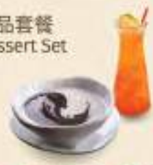
热甜品套餐 Hot Dessert Set

水磨杏仁糊 / 香滑红豆沙 / 水磨芝麻糊 / 鸳鸯糍 + 奶茶(冷) / 自制柠檬茶(冷) Almond Paste / Red Bean Paste / Sesame Paste / Yuan Yang Paste + Iced Milk Tea / Iced Homemade Lemon Tea