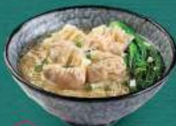
NO 02 港式水饺汤面 HK Dumpling Soup Noodle

金华火腿汤 OR 麻辣汤 Jinhua Ham Soup OR Mala Soup