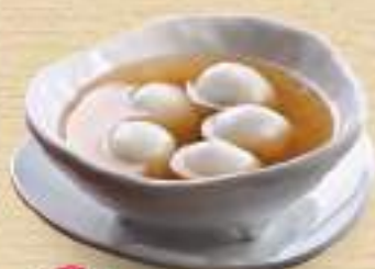
HD 10 汤圆加姜水 Rice Ball in Ginger Soup