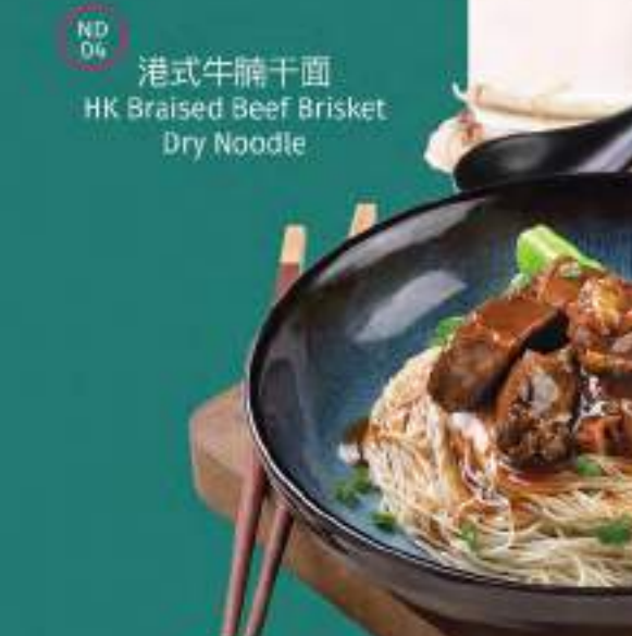
ND 04 港式牛腩干面 HK Braised Beef Brisket Dry Noodle