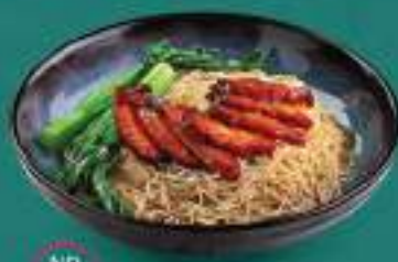
ND 03 港式叉烧干面 HK Char Siew Dry Noodle 蚝油酱 OR 香辣鱼香酱 Oyster Sauce Spicy Fish Fragrant Sauce