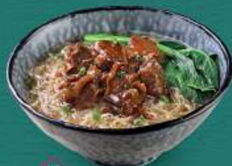
NO 04 港式牛腩汤面 HK Braised Beef Brisket Soup Noodle

金华火腿汤 OR 麻辣汤 Jinhua Ham Soup OR Mala Soup