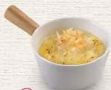
CD 16 桂花芦荟冰 Osmanthus Aloe Vera