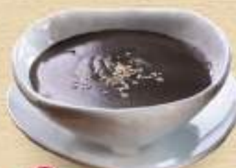
HD 05 水磨芝麻糊 Sesame Paste