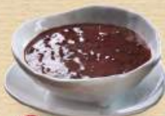
HD 04 香甜红豆沙 Red Bean Paste