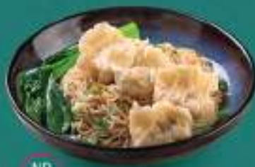
ND 02 港式水饺干面 HK Dumpling Dry Noodle 蚝油酱 OR 香辣鱼香酱 Oyster Sauce Spicy Fish Fragrant Sauce