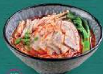
NO 27 咸肉麻辣汤面 Sliced Pork Belly Mala Soup Noodle

金华火腿汤 OR 麻辣汤 Jinhua Ham Soup OR Mala Soup