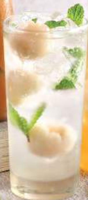
荔枝薄荷 Lychee Peppermint