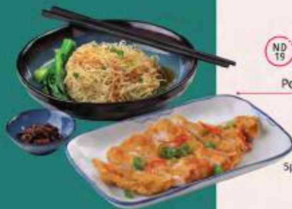
ND 19 港式猪扒干面 Pork Chop Dry Noodle