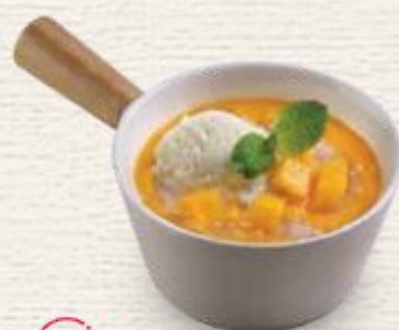
CD 04 雪球芒果西米露 Mango Sago with Vanilla Ice Cream | 6.5