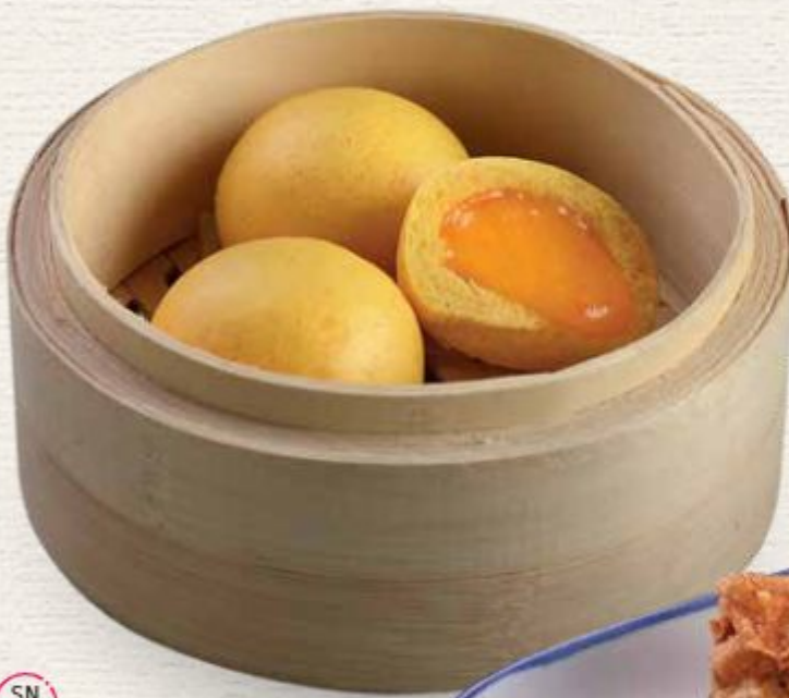
SN 07 港式流沙包 (三粒) SK Mini Lava Custard Pau (3pcs) | 3.6