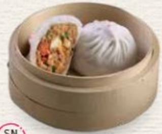
SN 20 港式大肉包 (一粒) HK Style Big Pork Pau (1pc) | 2.5