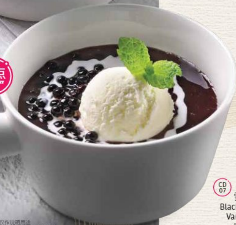
CD 07 雪球紫米蜂蜜球 Black Glutinous Rice with Vanilla Ice Cream and Honey Pearl | 5.3