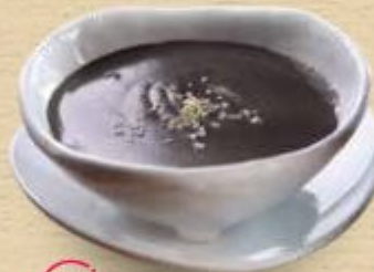
香甜红豆沙 Red Bean Paste | 3.5