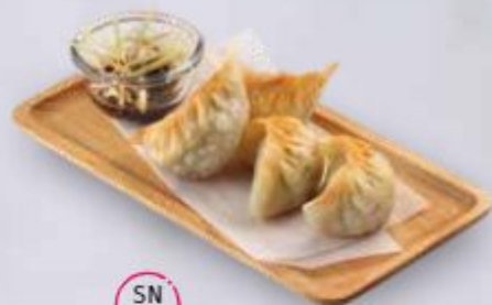
SN 37 锅贴 (四粒) Pan Fried Guo Tie (4pcs) | 5.3