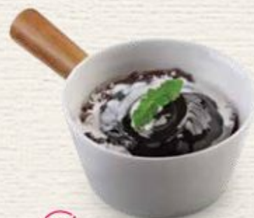
CD 27 紫米龟苓膏 Black Glutinous Rice with Herbal Jelly | 4.9

額外加收服務費及消費稅 | 圖片僅作說明用途 Prices are subject to service charge and prevailing GST. All photos of food items may not be exact representation of food dishes.