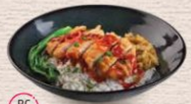
RC 13 港式西汁猪扒饭 Hong Kong Style Pork Chop Rice | 7.9