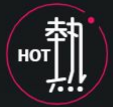
鸳鸯糊 Yuan Yang Paste | 3.9