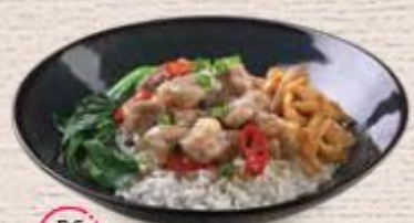
RC 19 豉汁蒸排骨饭 Steamed Pork Rib Rice | 7.6