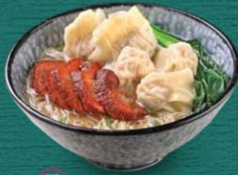
ND 15 盛記三拼汤面 SK Combination Soup Noodle | 9.9

金华火腿汤 OR 麻辣汤 Jinhua Ham Soup OR Mala Soup | +1.0