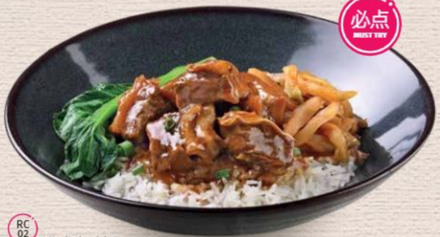
RC 02 港式牛腩饭 HK Braised Beef Brisket Rice | 9.5