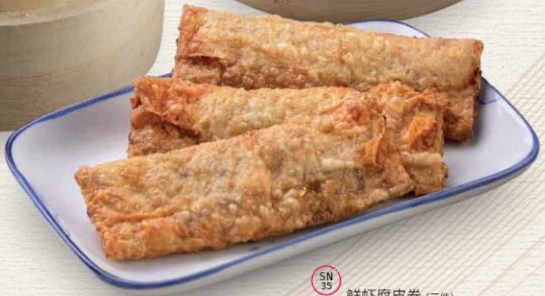
SN 35 鲜虾腐皮卷 (三件) Superior Prawn Fried Beancurd Skin Roll (3pcs) | 5.2