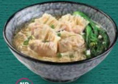
ND 02 港式水饺汤面 HK Dumpling Soup Noodle | 7.3

金华火腿汤 OR 麻辣汤 Jinhua Ham Soup OR Mala Soup | +1.0