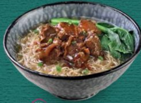
ND 04 港式牛腩汤面 HK Braised Beef Brisket Soup Noodle | 9.5

额外加收服务费及消费税 | 照片仅作参考用途 Prices are subject to service charge and prevailing GST. All photos of food items may not be exact representation of food dishes.