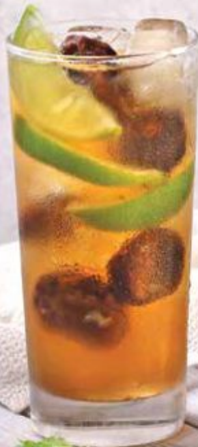
青柠酸梅 Green Lime with Plum Juice