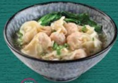
ND 05 皇牌云吞汤 Signature HK Wanton Soup | 7.3

金华火腿汤 OR 麻辣汤 Jinhua Ham Soup OR Mala Soup | +1.0