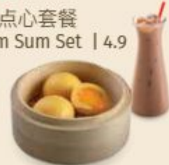
点心套餐 HK Dim Sum Set | 4.9

港式萝卜糕 / 港式流沙包 + 奶茶(冷) / 自制柠檬茶(冷) HK Carrot Cake / SK Mini Lava Custard Pau + Iced Milk Tea / Iced Homemade Lemon Tea