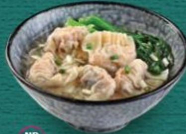
ND 06 港式水饺汤 HK Dumpling Soup | 7.3

金华火腿汤 OR 麻辣汤 Jinhua Ham Soup OR Mala Soup | +1.0