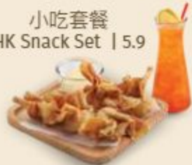
小吃套餐 HK Snack Set | 5.9

皇牌炸云吞 / 经典明虾饺 / 锅贴 + 奶茶(冷) / 自制柠檬茶(冷) Signature Deep Fried Wonton / Premium Prawn Dumpling / Pan Fried Guo Tie + Iced Milk Tea / Iced Homemade Lemon Tea