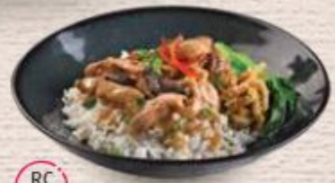
RC 16 酱皇香菇蒸鸡饭 Steamed Tender Chicken and Shiitake Mushroom Rice | 7.6