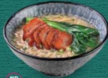
ND 03 港式叉烧汤面 HK Char Siew Soup Noodle | 6.9

金华火腿汤 OR 麻辣汤 Jinhua Ham Soup OR Mala Soup | +1.0