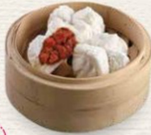
SN 08 港式蜜汁叉烧包 (两粒) HK Honey Char Siew Pau (2pcs) | 3.3