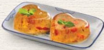
桂花芦荟冰 Osmanthus Aloe Vera | 4.9