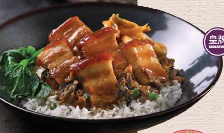
RC 01 梅菜扣肉饭 Braised Pork Belly with Mui Choy Rice | 7.9