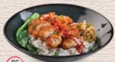
RC 17 香酥吉列鸡扒饭 Crispy Chicken Cutlet Rice | 7.6