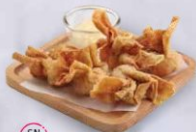
SN 38 皇牌炸云吞 (五粒) Signature Deep Fried Wonton (5pcs) | 4.9