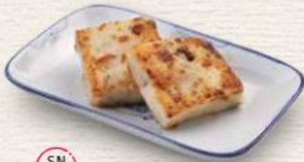
SN 04 港式萝卜糕 (两件) HK Carrot Cake (2pcs) | 3.6