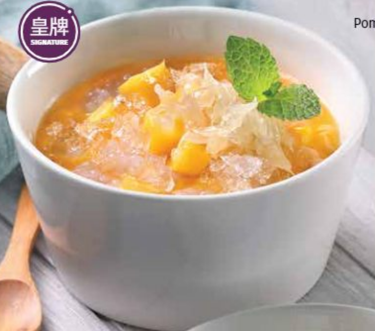
CD 01 盛記楊枝甘露 SK Mango Pomelo Sago | 5.5