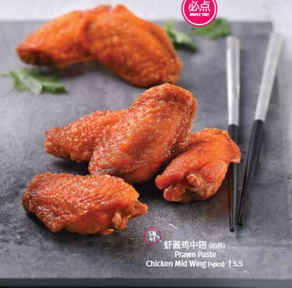
SN 41 虾酱鸡中翅 (四件) Prawn Paste Chicken Mid Wing (4pcs) | 5.5