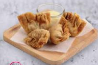
SN 39 经典明虾饺 (四粒) Premium Prawn Dumpling (4pcs) | 4.9