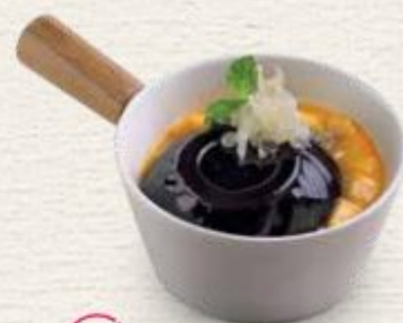
CD 12 楊枝龟苓膏 Mango Pomelo Herbal Jelly | 5.5